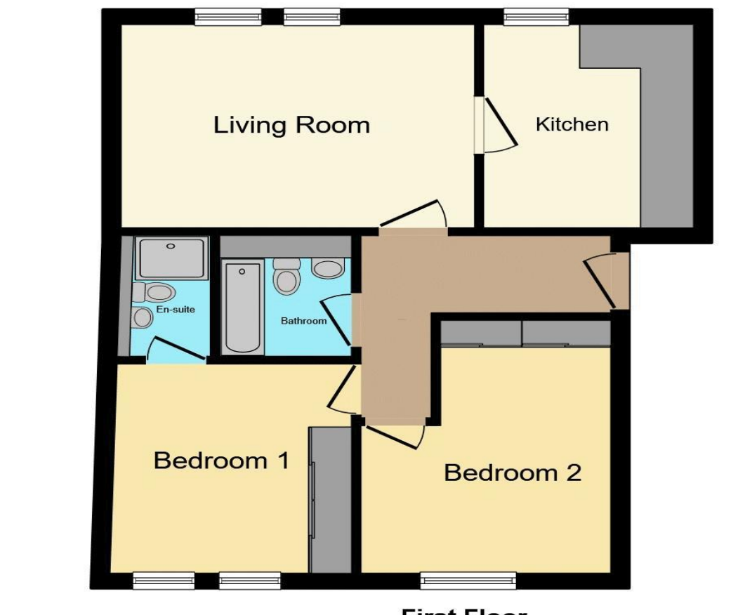
First Floor Floor area 44.5 sq.m. (479 sq.ft.) approx

This floor plan is for illustrative purposes only. It is not drawn to scale. Any measurements, floor areas (including any total floor area), openings and orientation are approximate. No details are guaranteed, they cannot be relied upon for any purpose and they do not form part of any agreement. No liability is taken for any error, omission or misstatement. A party must rely upon its own inspection(s). Plan produced for GetAnOffer. Powered by www.focalagent.com