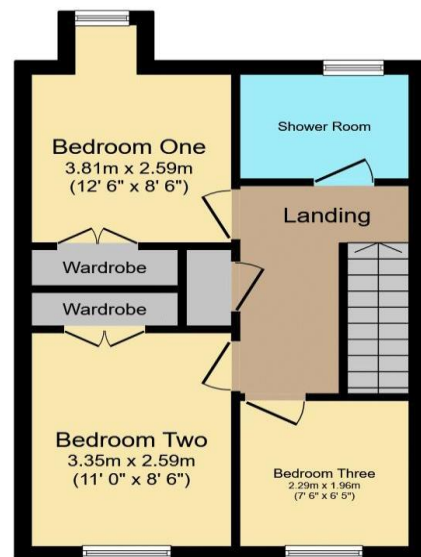
First Floor Floor area 36.7 m 2 (395 sq.ft.) approx

This floor plan is for illustrative purposes only. It is not drawn to scale. Any measurements, floor areas (including any total floor area), openings and orientation are approximate. No details are guaranteed, they cannot be relied upon for any purpose and they do not form part of any agreement. No liability is taken for any error, omission or misstatement. A party must rely upon its own inspection(s). Plan produced for GetAnOffer. Powered by www.focalagent.com