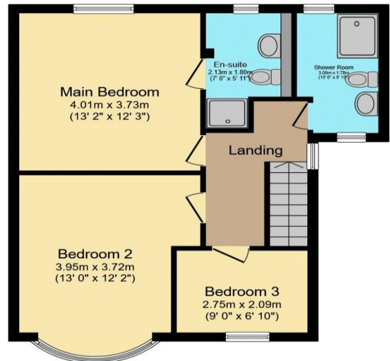
First Floor Floor area 54.5 m 2 (587 sq.ft.) approx

This floor plan is for illustrative purposes only. It is not drawn to scale. Any measurements, floor areas (including any total floor area), openings and orientation are approximate. No details are guaranteed, they cannot be relied upon for any purpose and they do not form part of any agreement. No liability is taken for any error, omission or misstatement. A party must rely upon its own inspection(s). Plan produced for GetAnOffer. Powered by www.focalagent.com