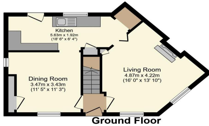
Floor area 42.7 m 2 (459 sq.ft.) approx