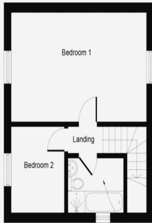
First Floor Approximate Floor Area