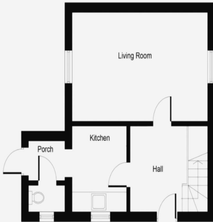
Ground Floor Approximate Floor Area