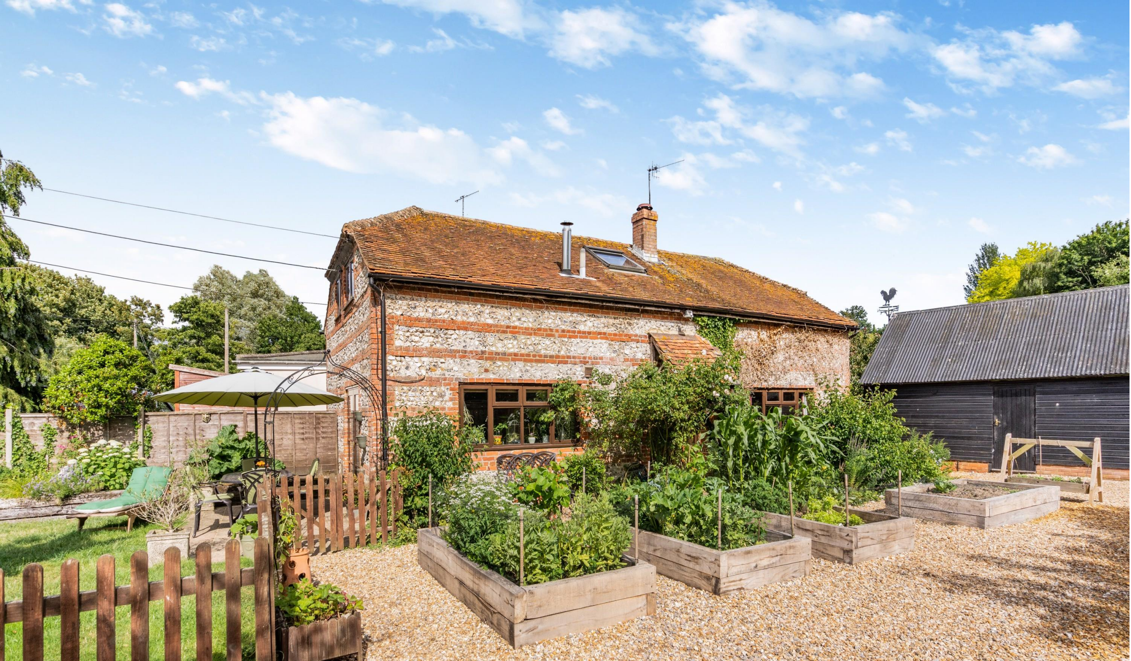
Owl Cottage, Newton Toney, Salisbury, Wiltshire