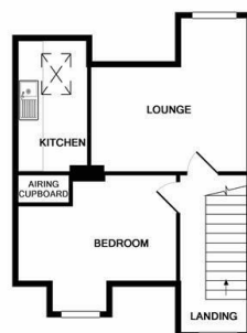
1ST FLOOR APPROX. FLOOR AREA 399 SQ.FT. (37.1 SQ.M.)