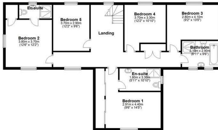
Main area: Approx. 230.2 sq. metres (2478.0 sq. feet) Plus garages: approx. 32.5 sq. metres (348.0 sq. feet) 15 Knights Grove

Indicative floor plans only - NOT TO SCALE - All floor plans are included only as a guide and should not be relied upon as a source of information for area, measurement or detail.