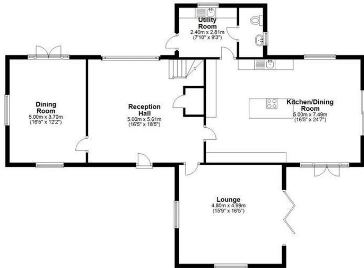
First Floor Approx. 110.5 sq. metres (1189.9 sq. feet)