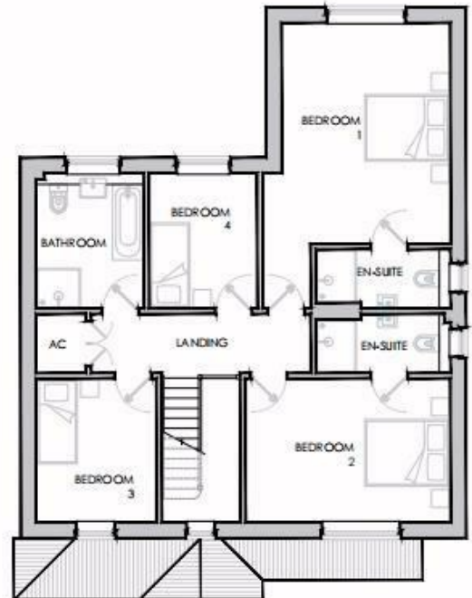
2 PROPOSED FIRST FLOOR G.A. SCALE: 1:40

Indicative floor plans only - NOT TO SCALE - All floor plans are included only as a guide and should not be relied upon as a source of information for area, measurement or detail.