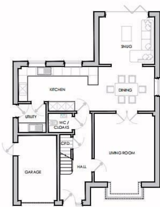
1 PROPOSED GROUND FLOOR G.A. SCALE: 1:40