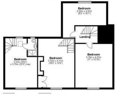
Second Floor Approx. 67.7 sq. metres (726.4 sq. feet)