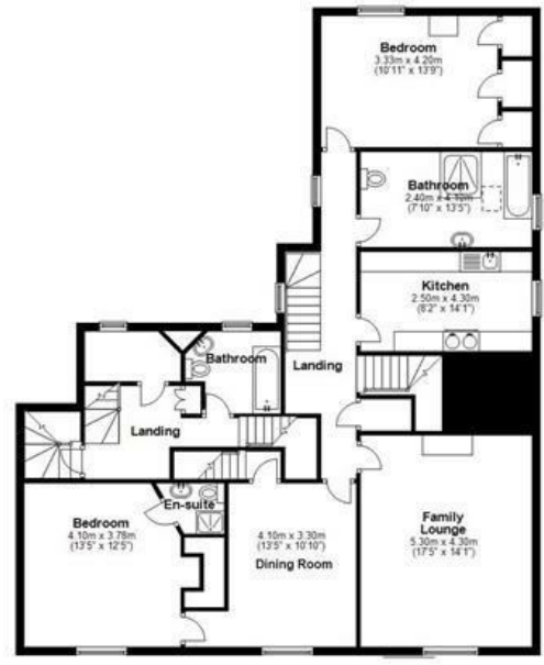
Second Floor Approx. 67.7 sq. metres (726.4 sq. feet)