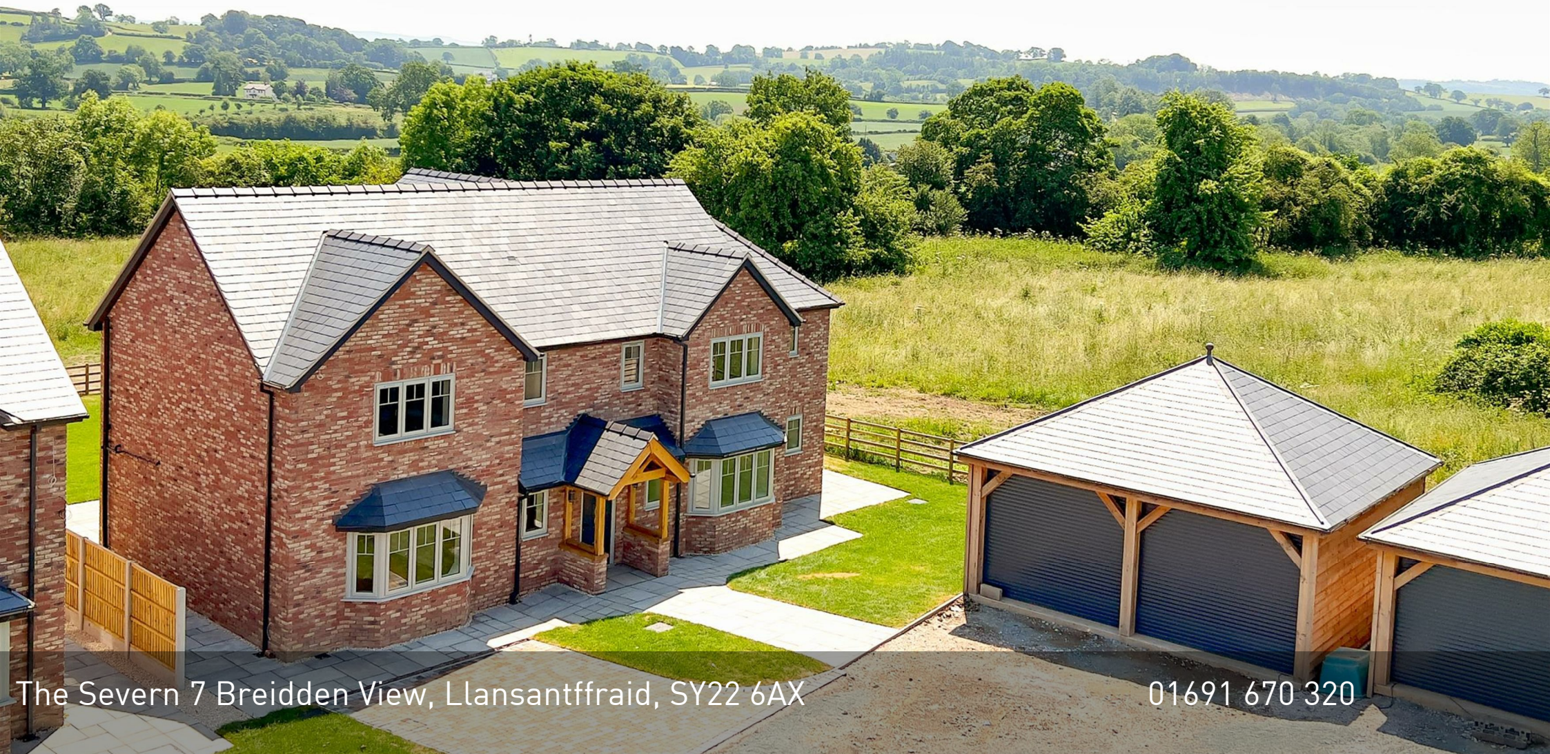
The Severn 7 Breidden View, Llansantffraid, SY22 6AX