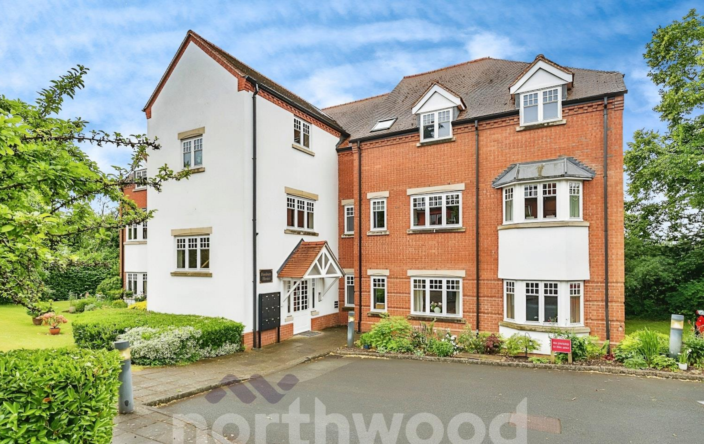
Hanbury House, Battenhall Road, Worcester