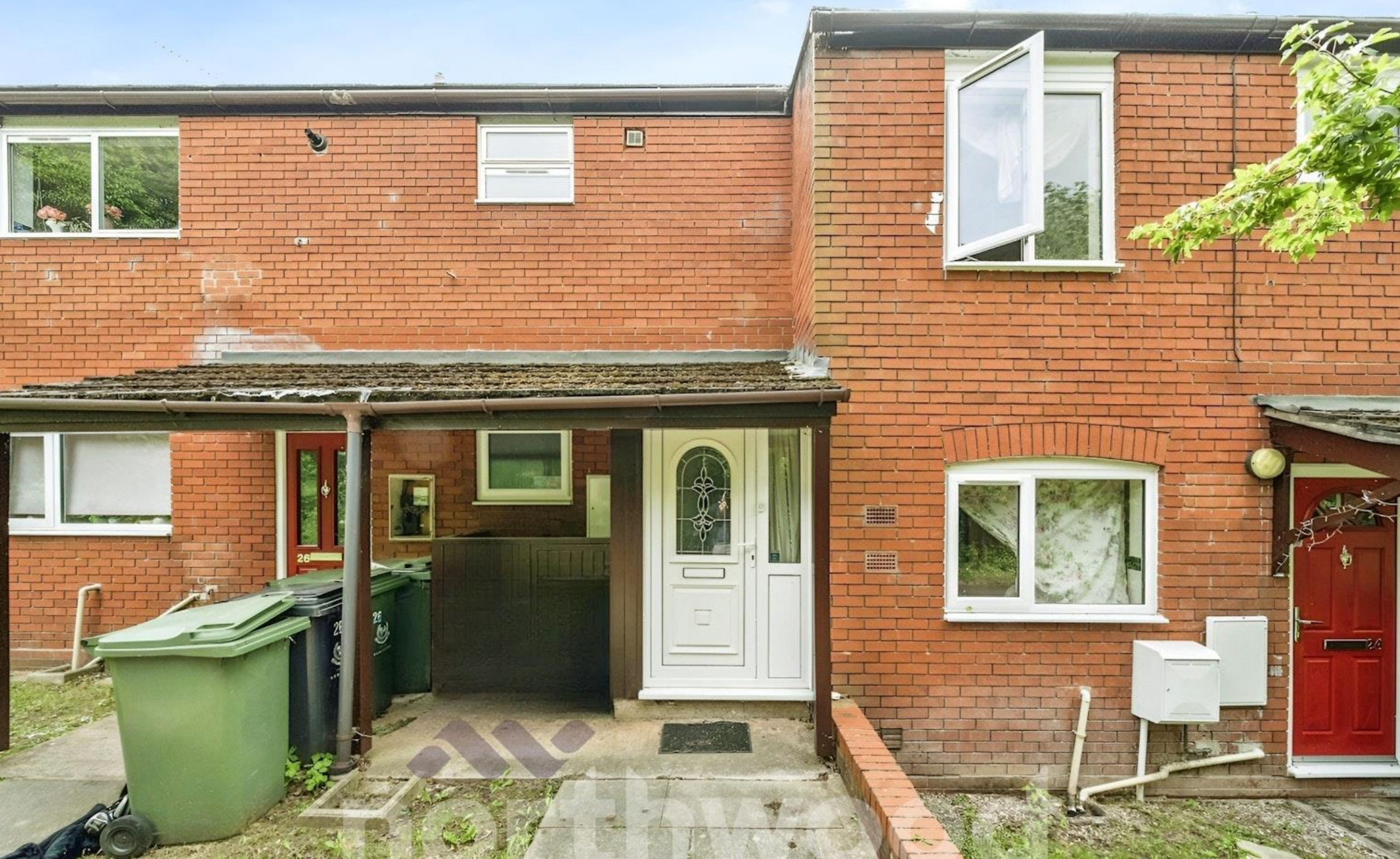
Dalegarth Court, Worcester