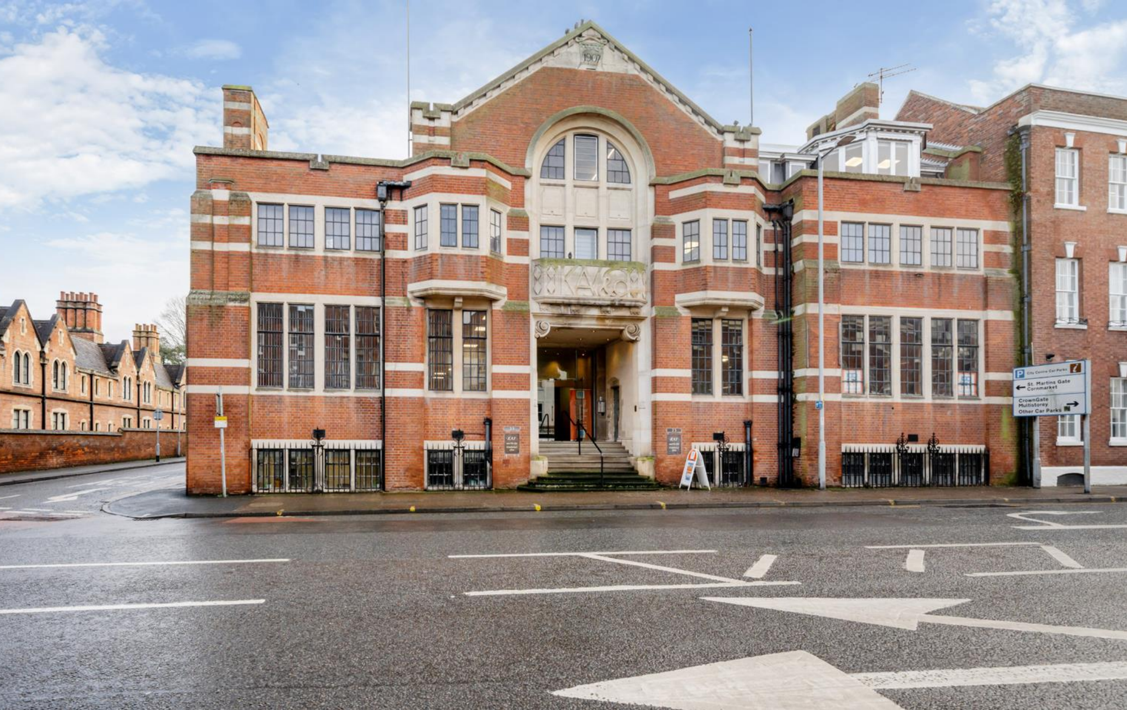
2 Surman Street, City Centre, Worcester