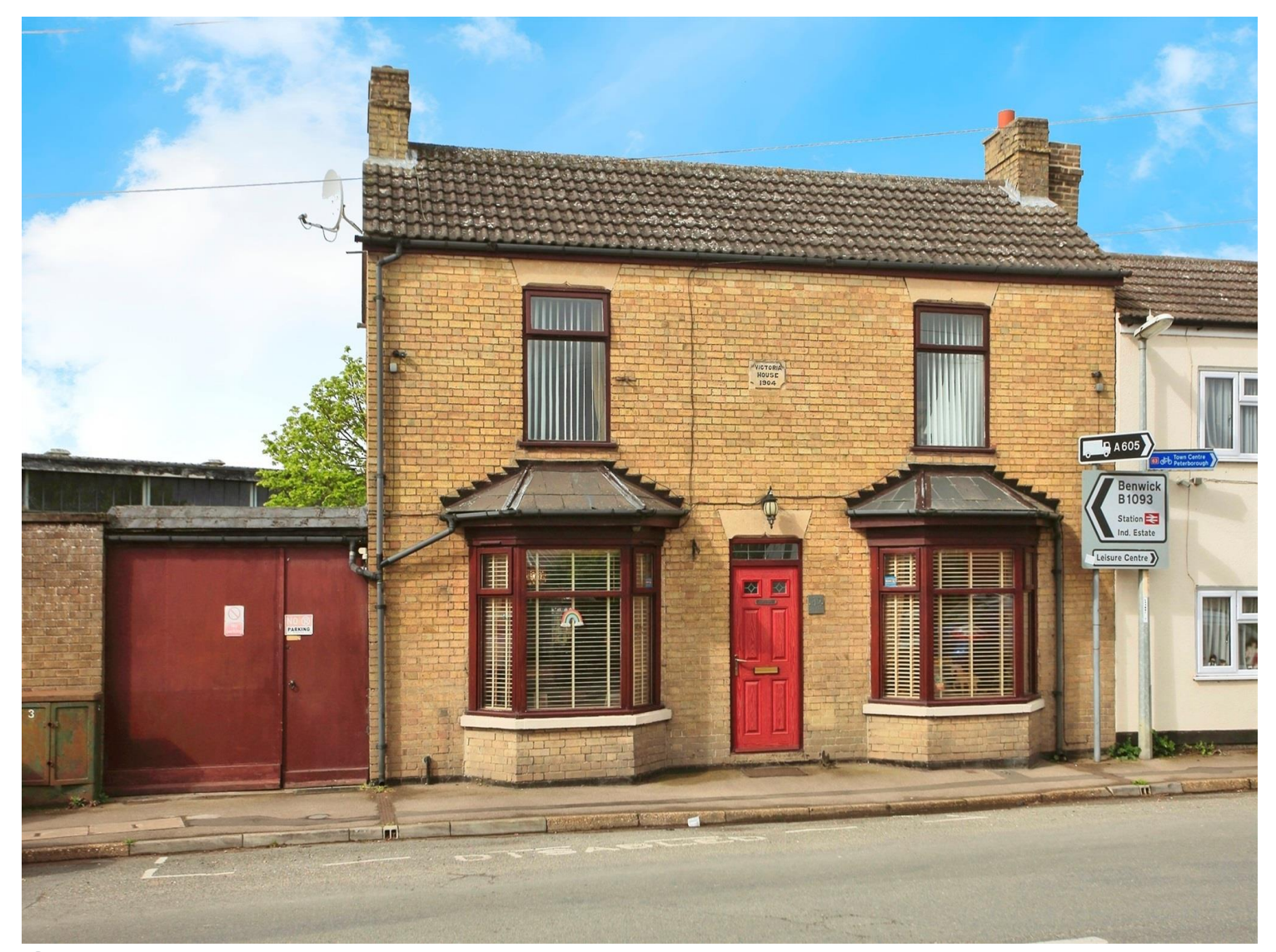
Station Road Whittlesey Peterborough PE7 1UA