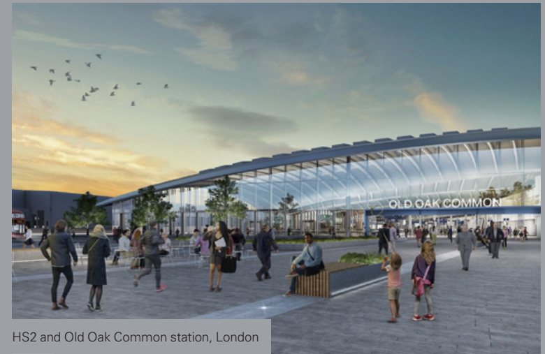
HS2 and Old Oak Common station, London