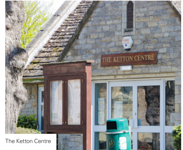
The Ketton Centre