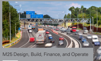
M25 Design, Build, Finance, and Operate