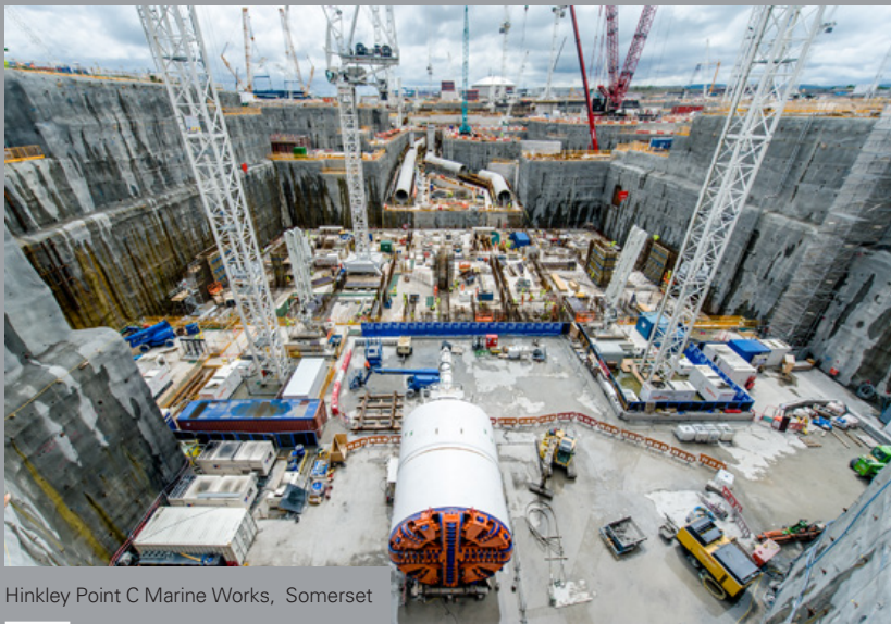
Hinkley Point C Marine Works, Somerset