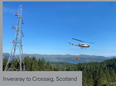
Inveraray to Crossaig, Scotland