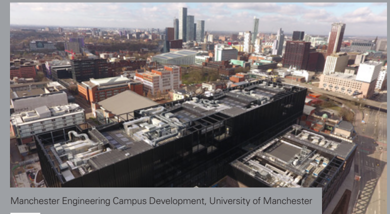
Manchester Engineering Campus Development, University of Manchester