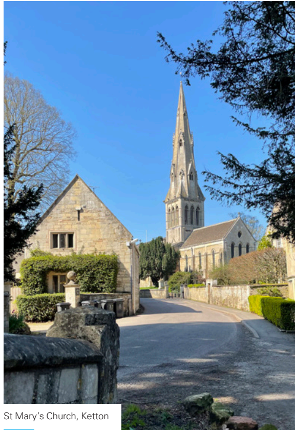
St Mary's Church, Ketton