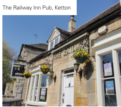
The Railway Inn Pub, Ketton