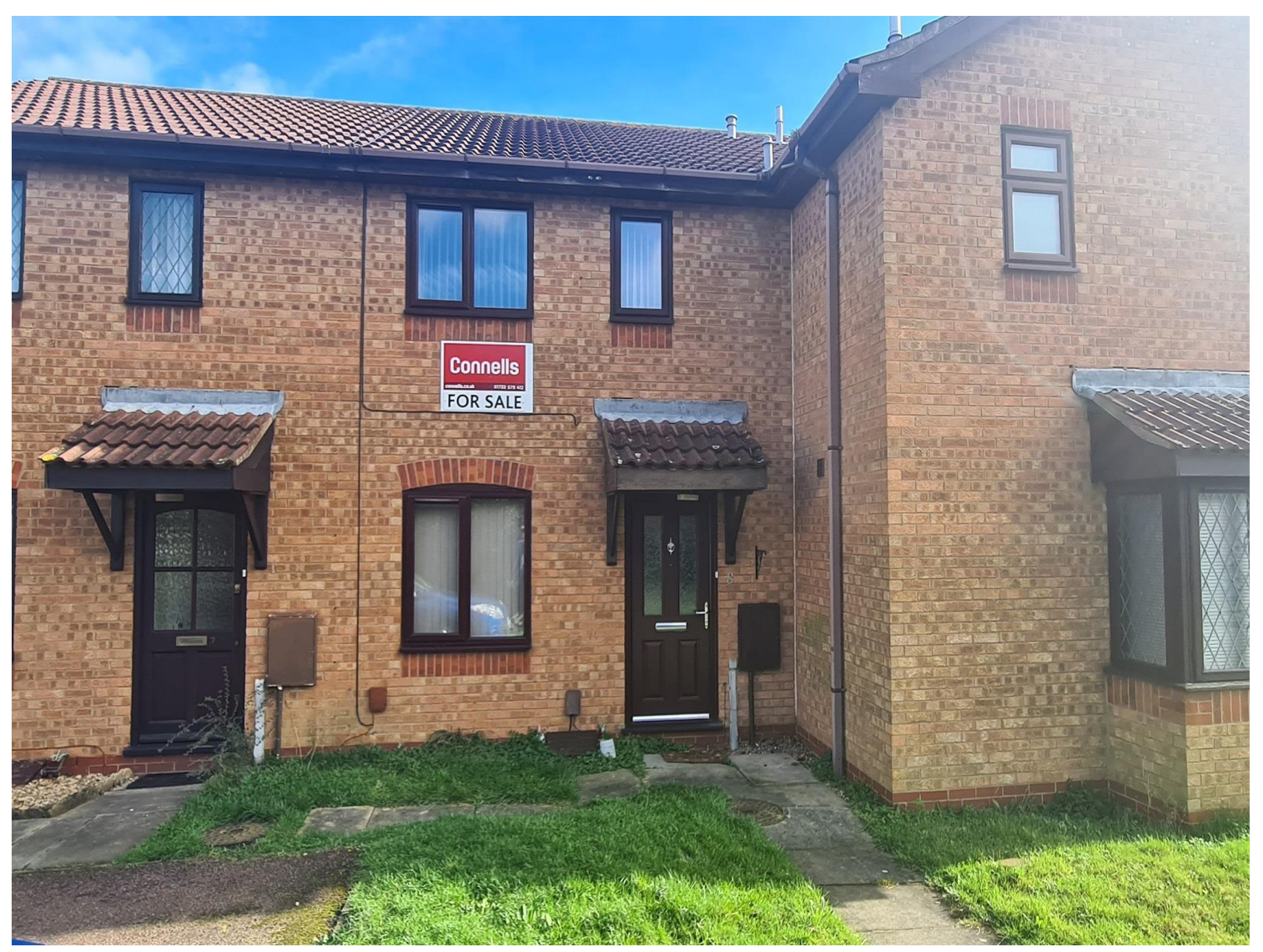
Woodpecker Court Peterborough PE4 7FJ