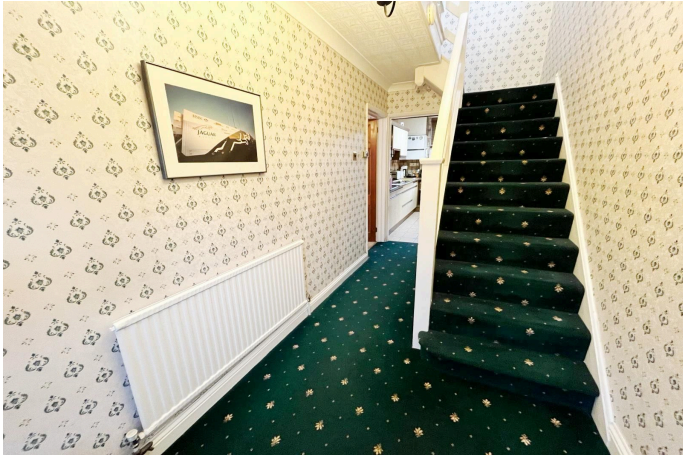
18 Tiverton Avenue, Kingsthorpe, Northampton NN2 8LY £275,000 Freehold