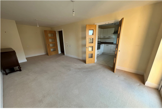
24, Wardington Court Welford Road, Kingsthorpe, Northampton NN2 8FR £170,000 Leasehold