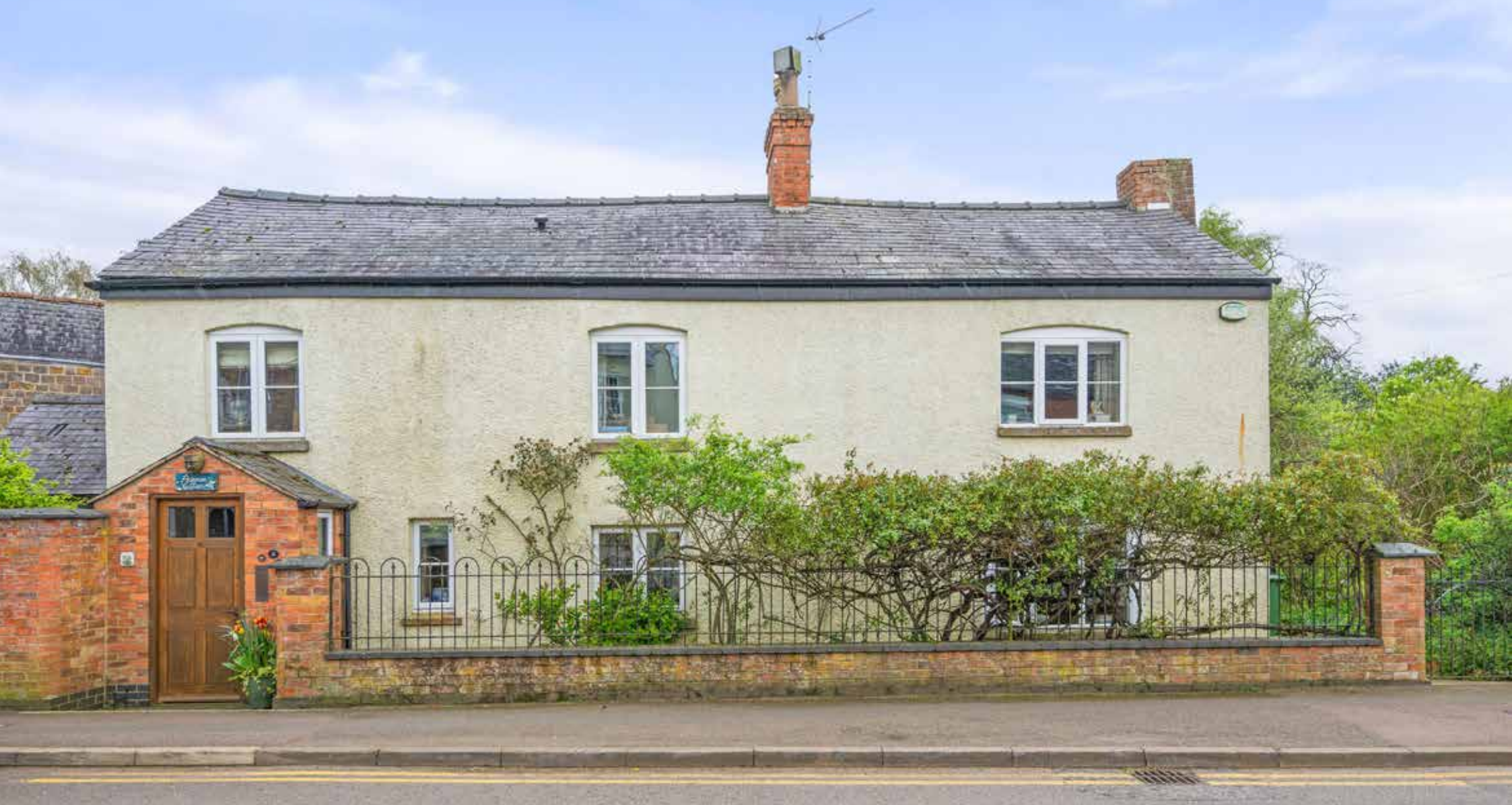
Primrose Cottage Leicester Road | Uppingham | Rutland | LE15