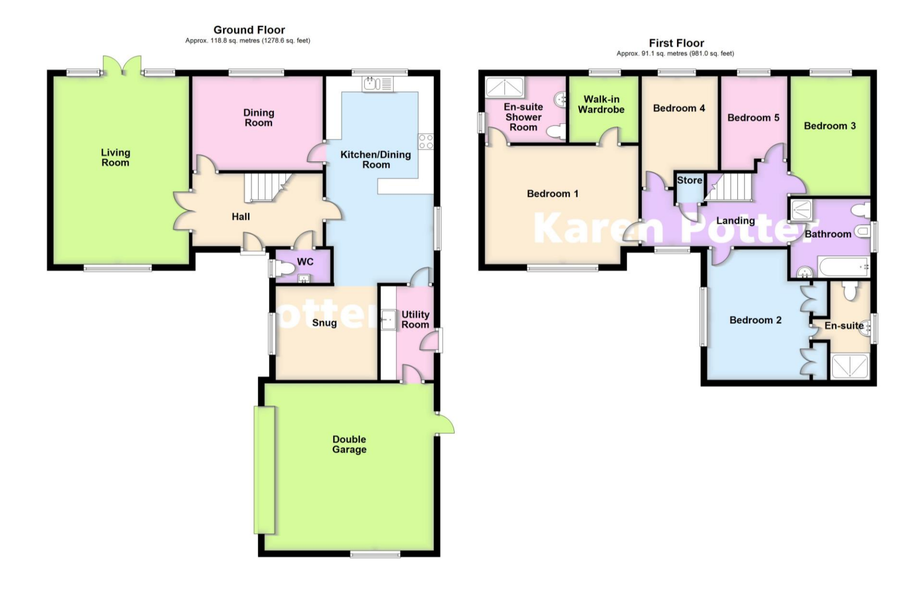
Total area: approx. 209.9 sq. metres (2259.6 sq. feet)