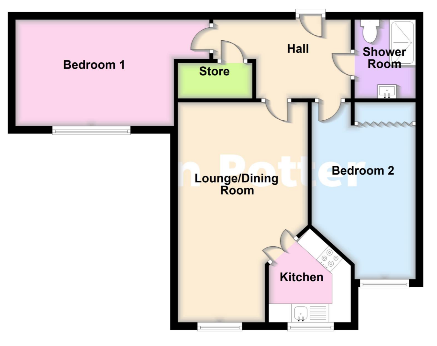
Total area: approx. 61.7 sq. metres (663.8 sq. feet)

Approx. 61.7 sq. metres (663.8 sq. feet)