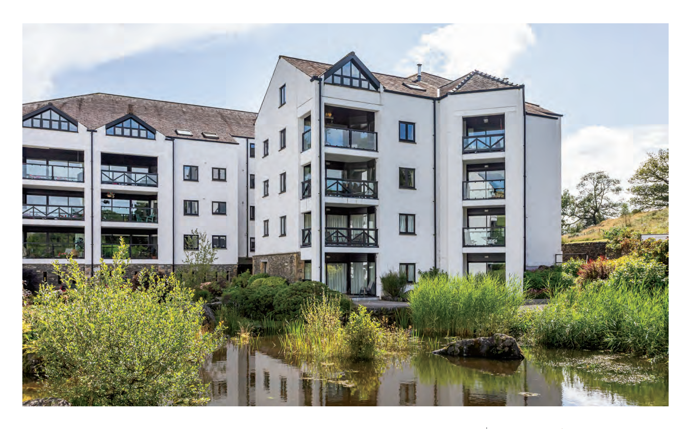
4 Ellerbank Cowan Head | Burneside | The Lake District | LA8 9HX