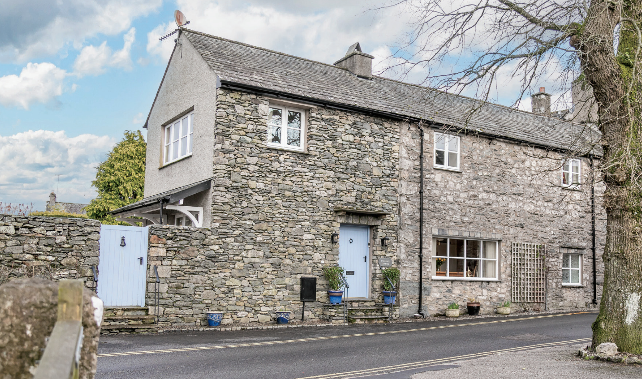
Parkgate Cottage The Square | Cartmel | The Lake District | LA11 6QB