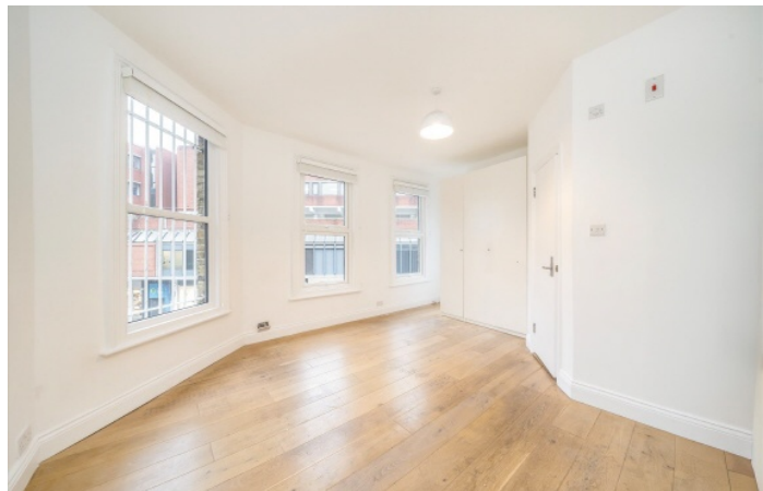
High Road, N22