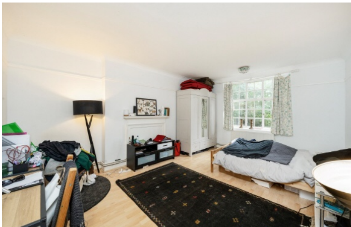
Fortis Green, N10