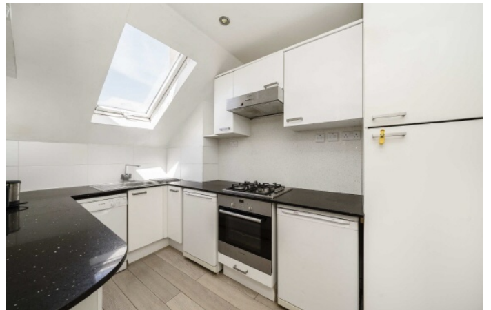
Muswell Hill Road, N10