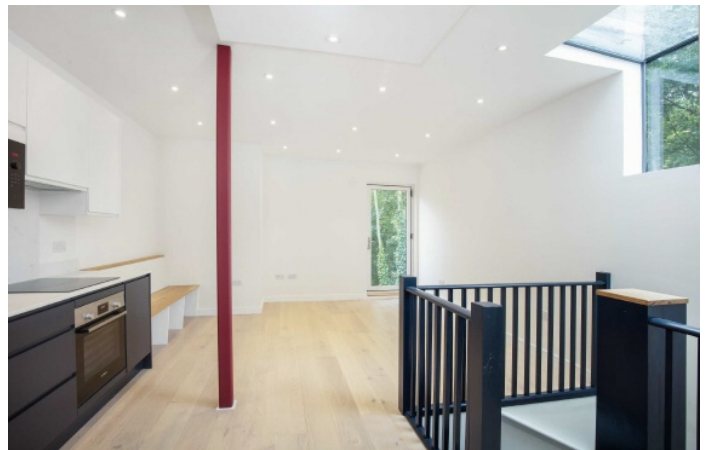
Muswell Hill, N10