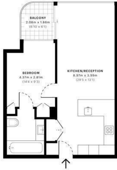
- Fifteenth Floor