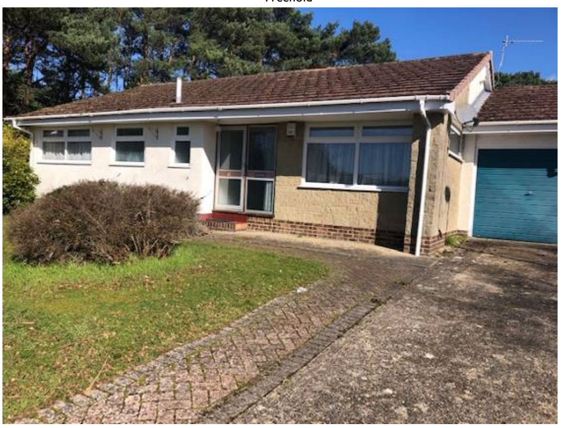
FIRST TIME ON MARKET SINCE CONSTRUCTION IN THE MID 70'S!

BOUGHT OFF PLAN BY THE CURRENT OWNERS THIS TRADITIONAL DETACHED BUNGALOW OFFERS TREMENDOUS SCOPE FOR SOMEONE TO CREATE A LOVELY HOME.