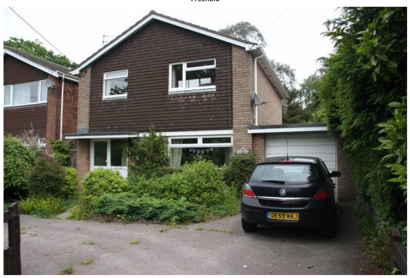
A spacious and well presented 3 bedroom detached family home located in the ever popular district of West Christchurch.

In brief the accommodation comprises of Entrance Hall, Utility/Ground Floor Cloaks, well proportioned Lounge/Diner and Modern style kitchen to the ground floor. To the first floor there is the landing with feature window, 3 good size bedrooms and family bathroom with bath and separate shower cubicle.