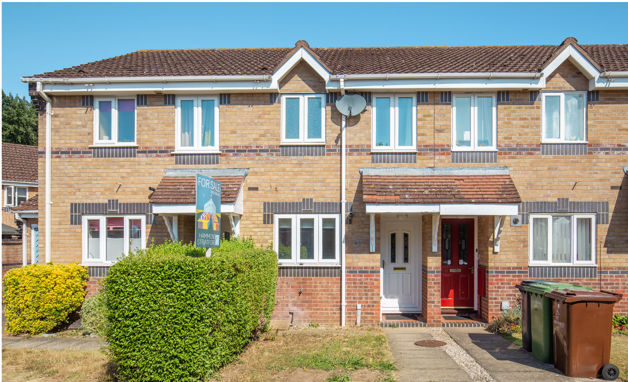
12 WILLOW COURT Attleborough, Norfolk, NR17 1TD