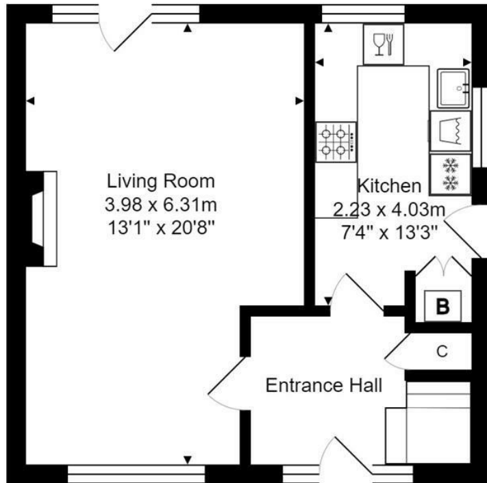
Ground Floor Area: 40.3 m 2 ... 434 ft 2