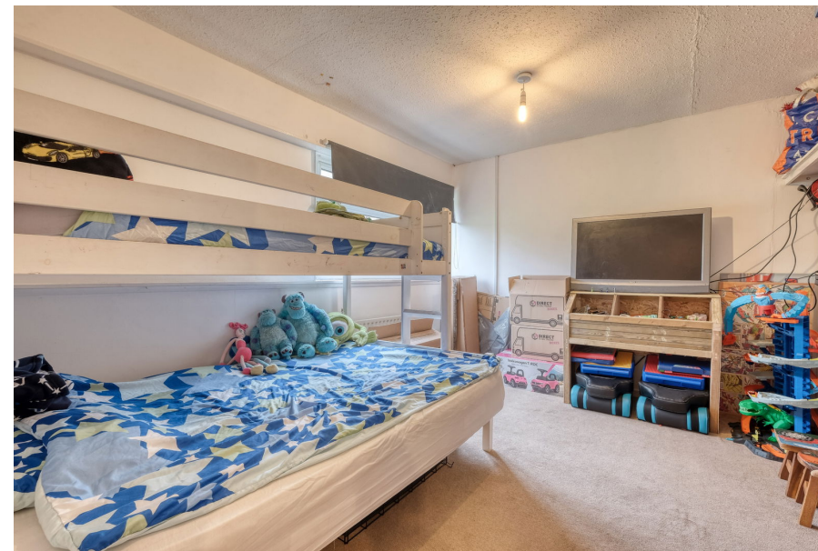
Astley Close, Redditch

A deceptively spacious three bedroom end of terrace property, being sold with no upward chain, offered with kitchen/diner, lounge, family bathroom and guest WC, enclosed rear garden, communal parking and situated in the popular location of Woodrow, Redditch.