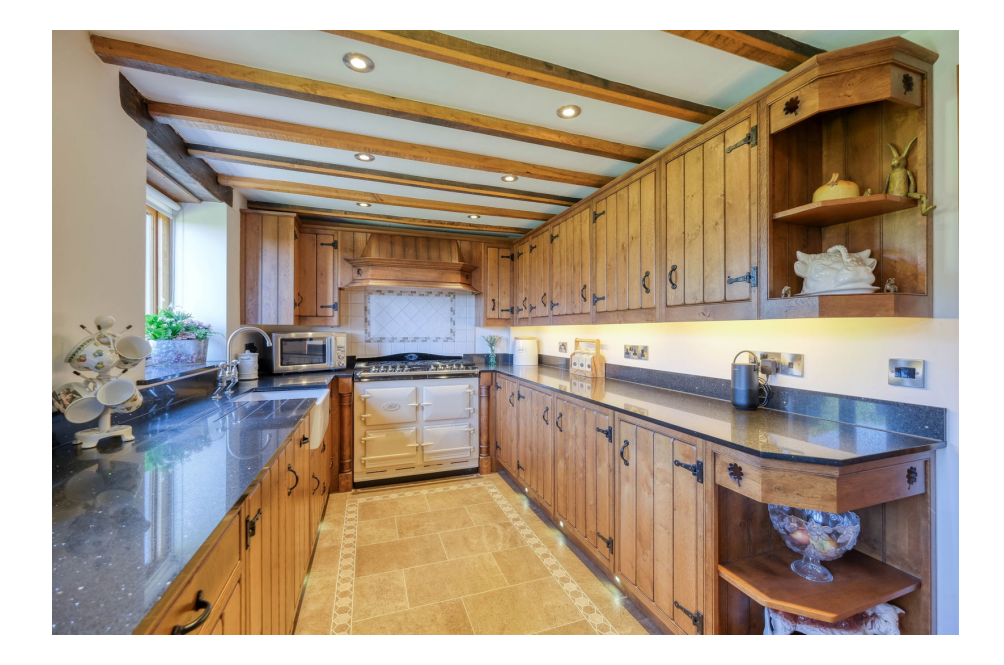
Edgioake Barn, Edgioake Lane, Astwood Bank

Nestled in Astwood Bank, this delightful Grade II listed barn conversion is brimming with character, boasting wooden beams throughout and a wealth of period features. The property offers the perfect blend of rustic charm and modern convenience, with off-road parking, a single garage, and a spacious garden ideal for entertaining.