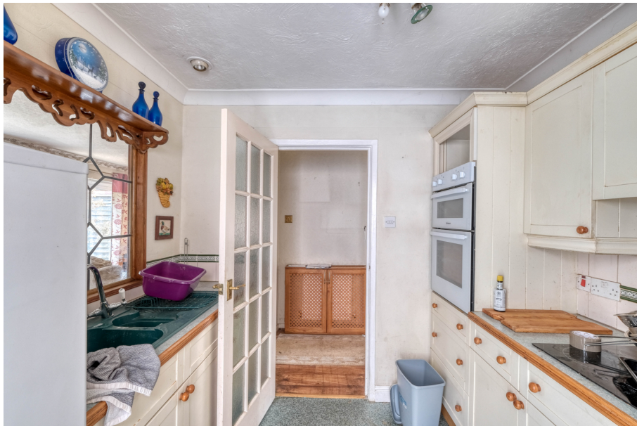
Mason Road, Redditch Ground Floor