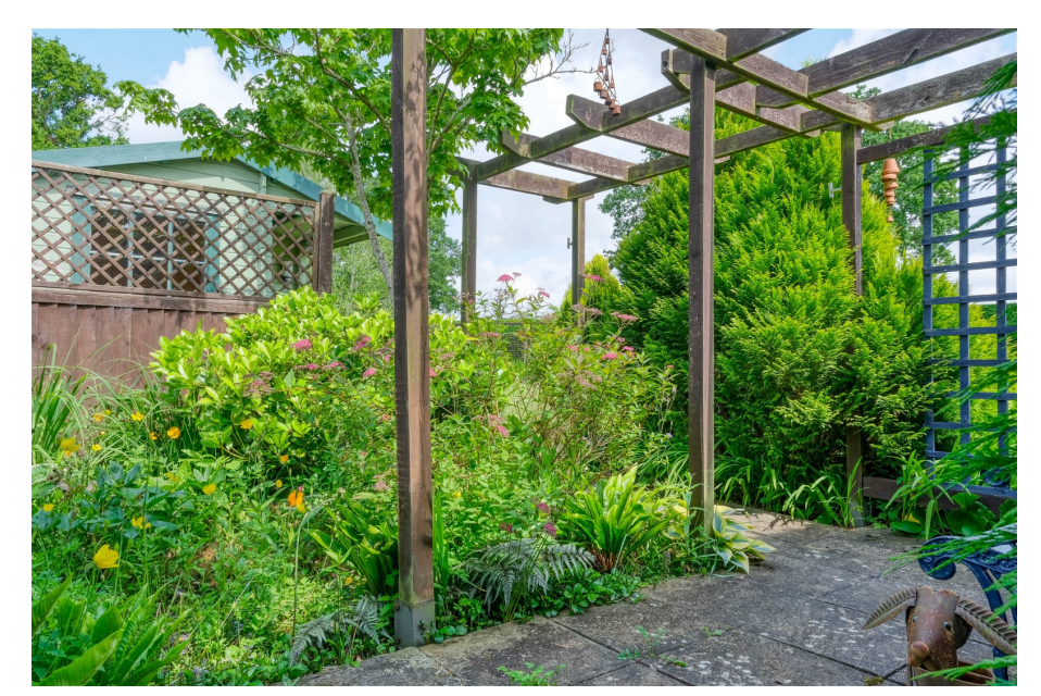
The Twistle, Perrymill Lane, Sambourne

A superbly appointed four-bedroom detached dormer bungalow, situated in Sambourne, offering circa 2443sq. ft. of generously-proportioned accommodation, ample off road parking, tandem double garage and a wonderful extensive rear garden.