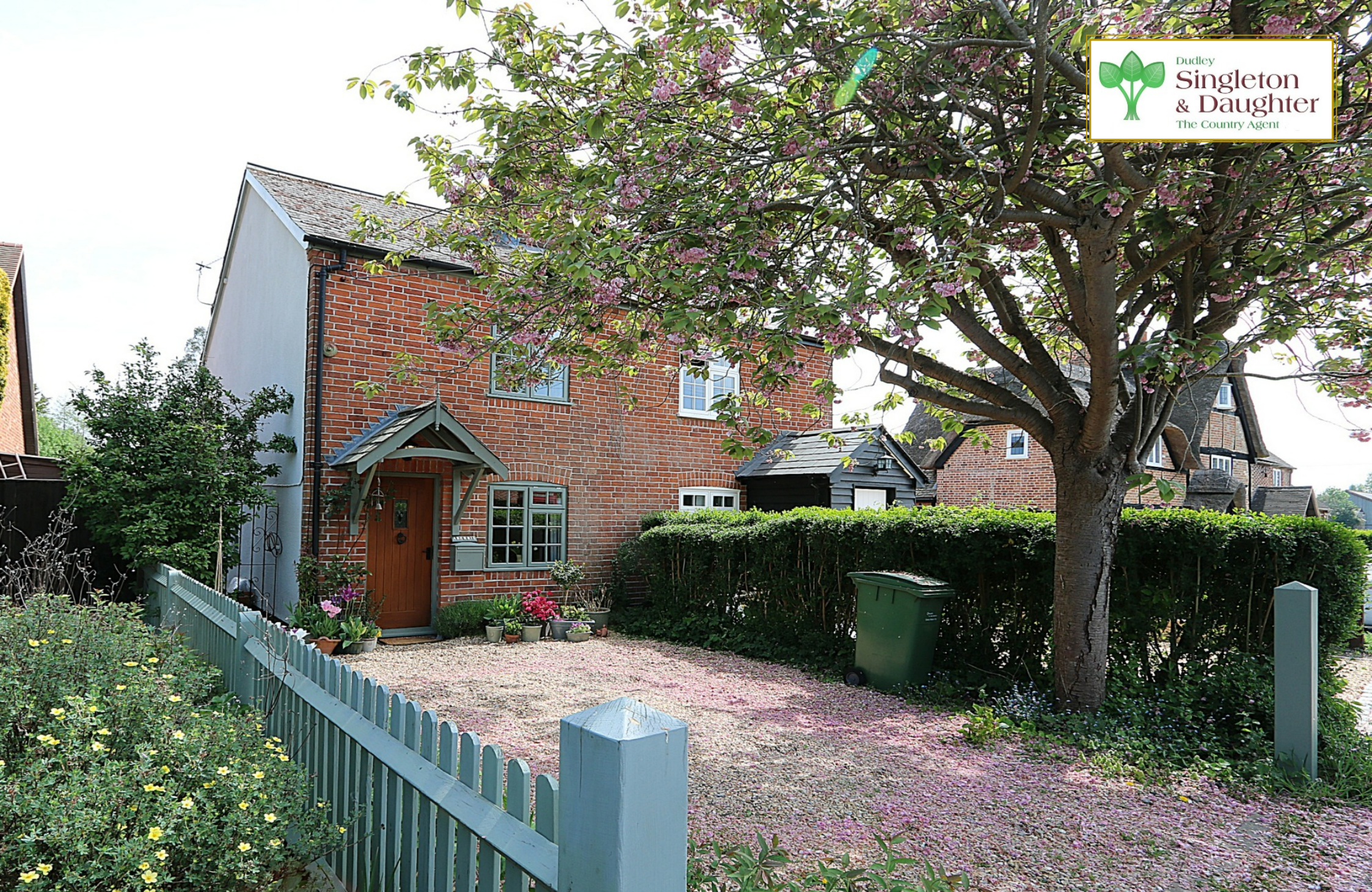
Aberrie • North Street • Englefield • Berkshire