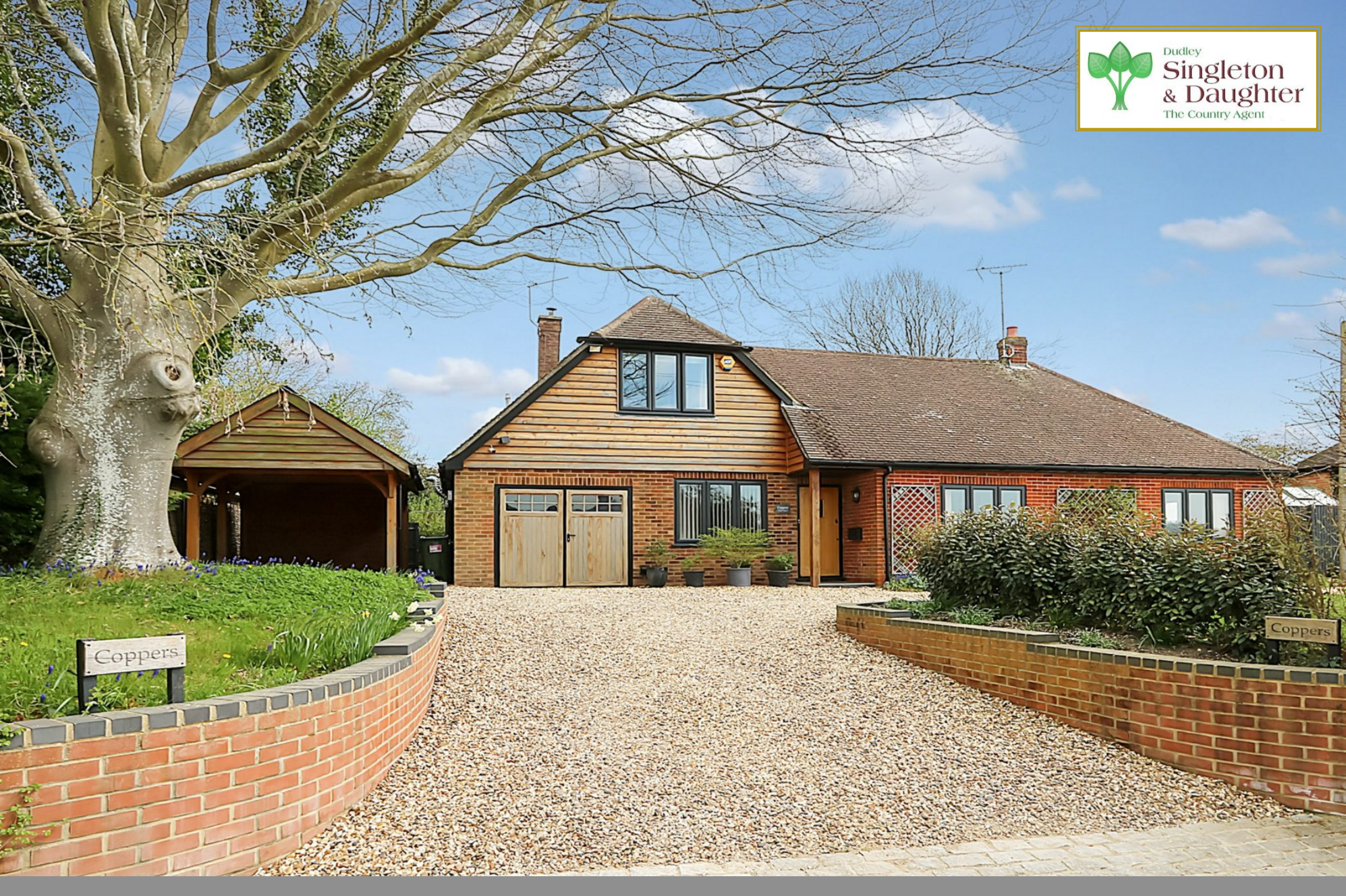
Coppers • Stanford Dingley • Berkshire