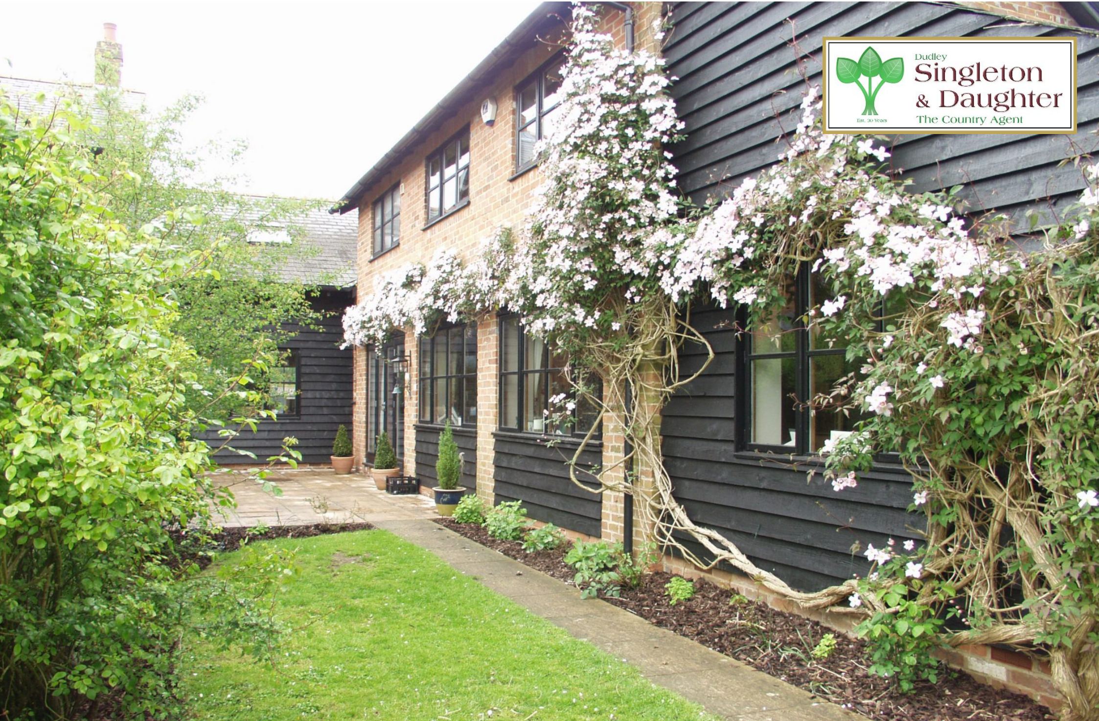
Stable Cottage • Ashampstead • Berkshire