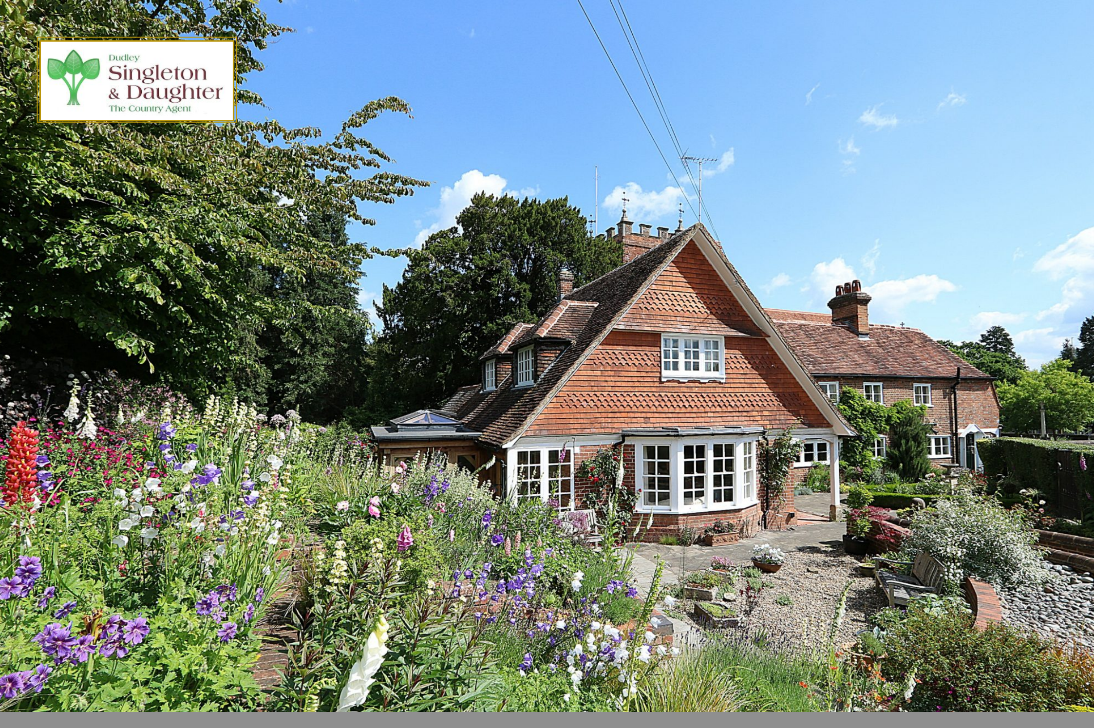
Church Cottage • Pangbourne • Berkshire