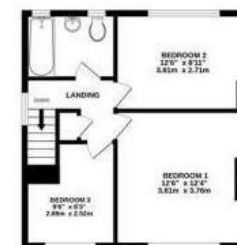
TOTAL FLOOR AREA: 867 sq ft (79.7 sq m.) approx.

While every attempt has been made to ensure the accuracy of the descriptive material herein, measurement of doors, windows, floors and any other items are approximate and no responsibility is taken for any omission or misstatement. This plan is for illustrative purposes only and should be used as such by any prospective purchaser. The services, systems and accessories shown have not been tested and no guarantee as to their operability or efficiency can be given.