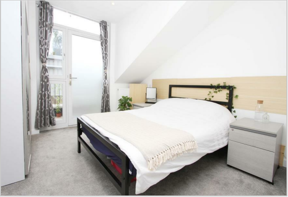
GROUND FLOOR 299 sq. ft. (27.8 sq. m.)