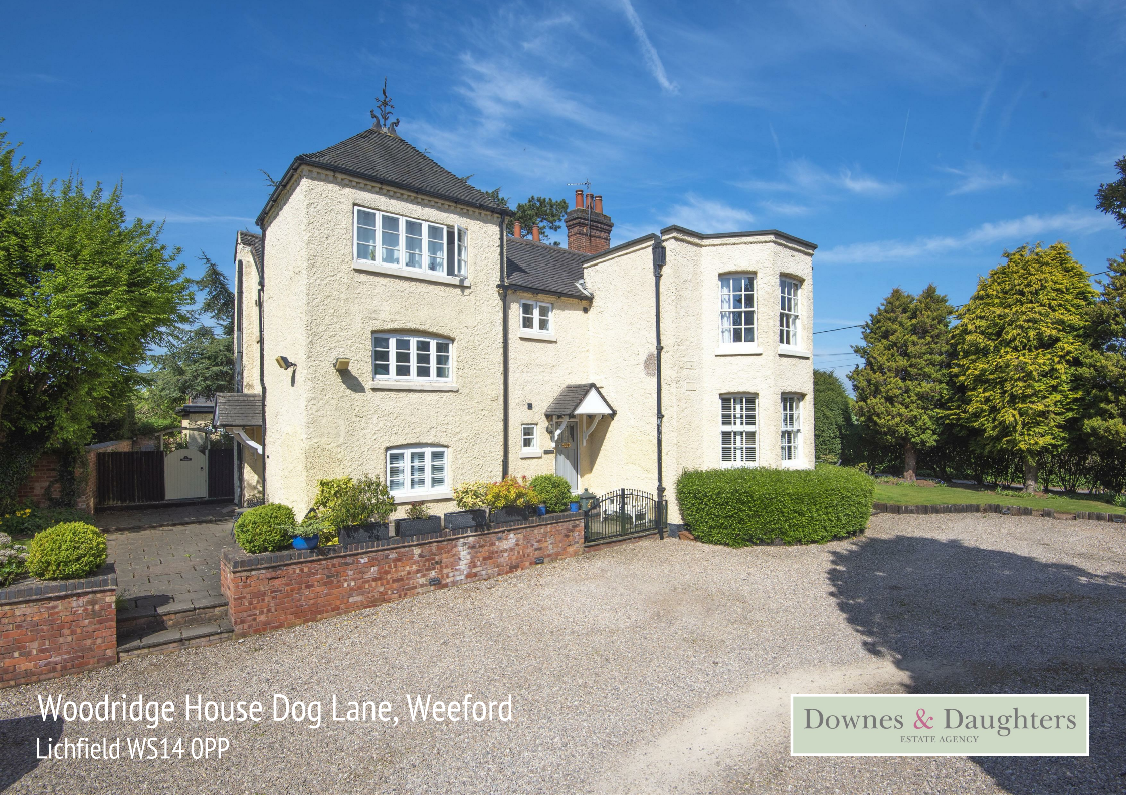
Woodridge House Dog Lane, Weeford Lichfield WS14 0PP