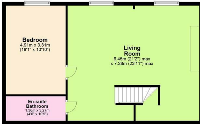
Basement Floor Approx. 68.1 sq. metres (733.3 sq. feet)