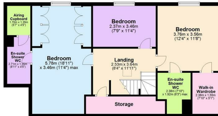
Second Floor Approx. 74.1 sq. metres (797.5 sq. feet)