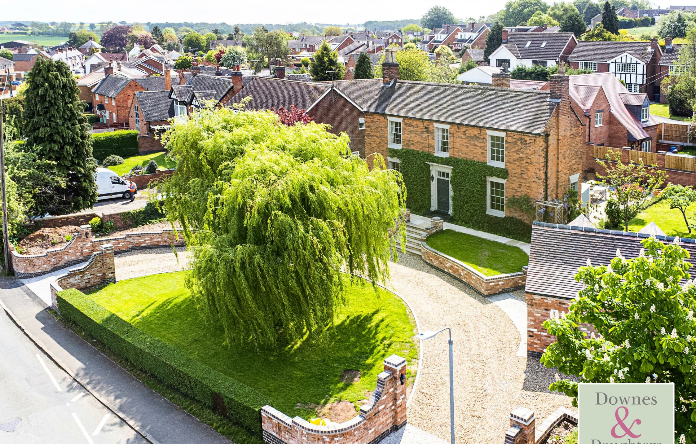
ROCK BANK HOUSE | MAIN STREET | | STAFFORDSHIRE | B79 0AP