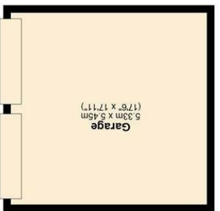
Garage Approx. 29.0 sq. metres (312.7 sq. feet)