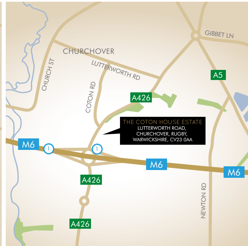
LOCAL AREA MAP