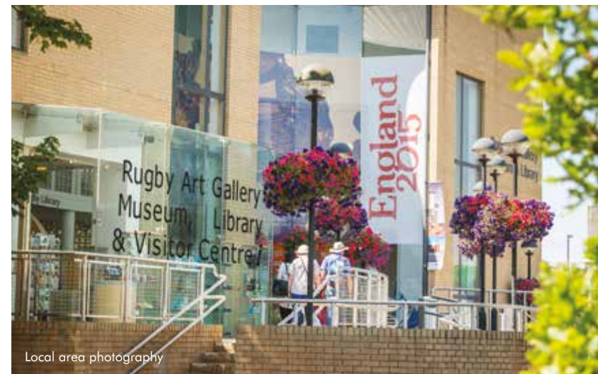
Local area photography