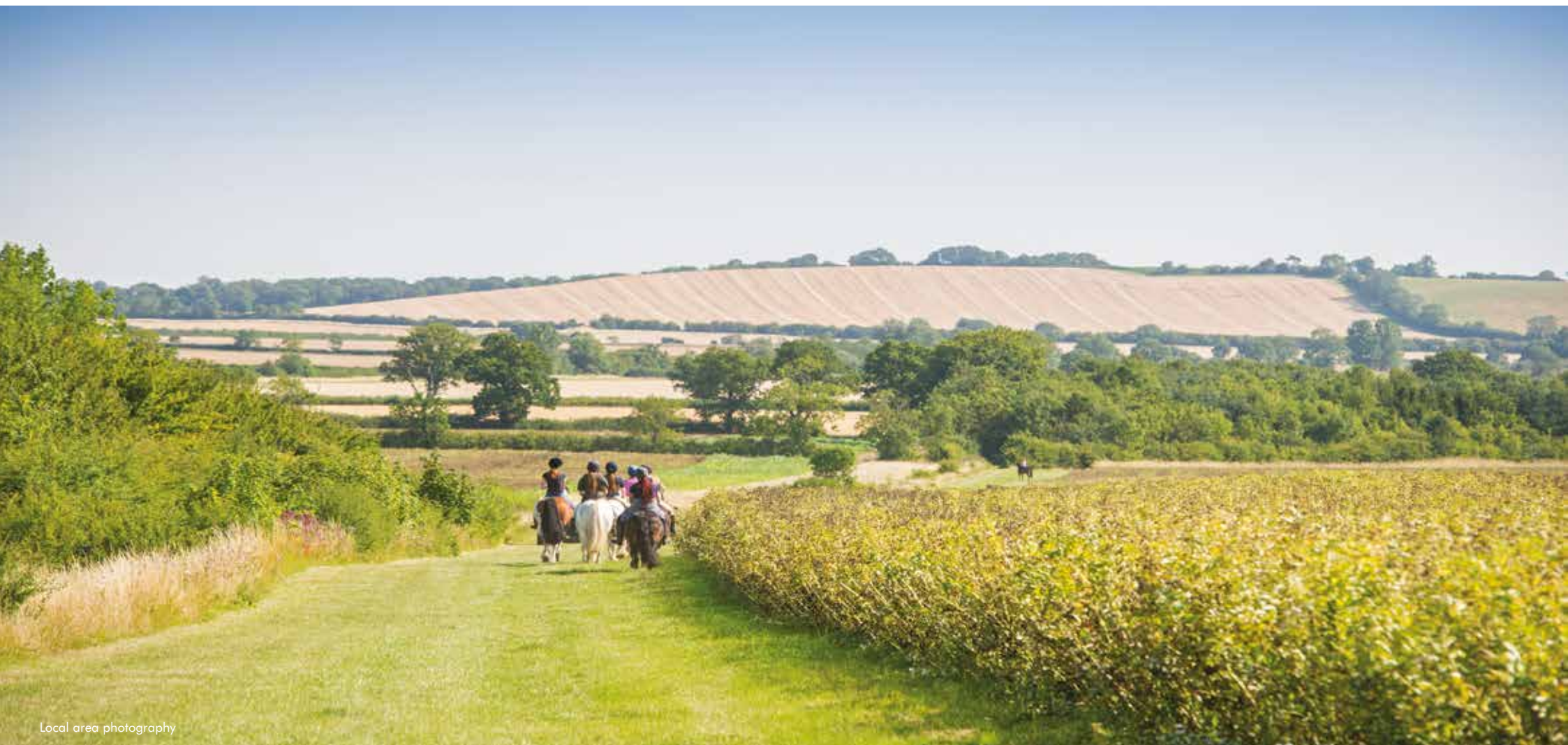
Local area photography