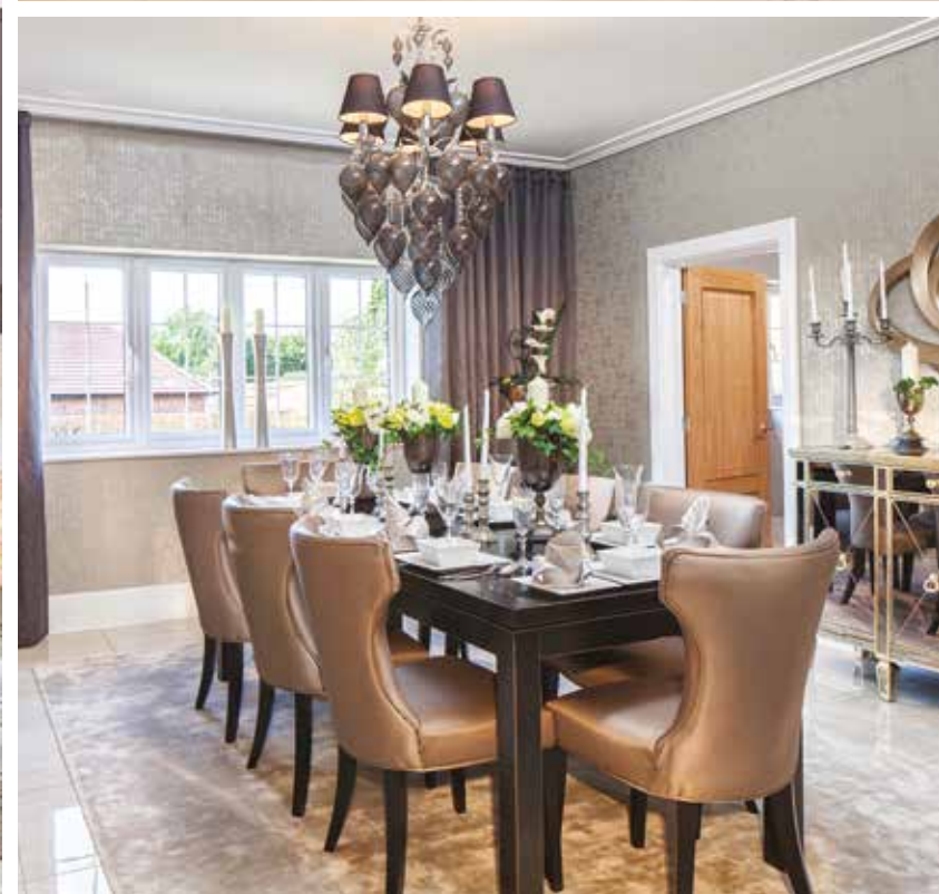
Photography from a previous development