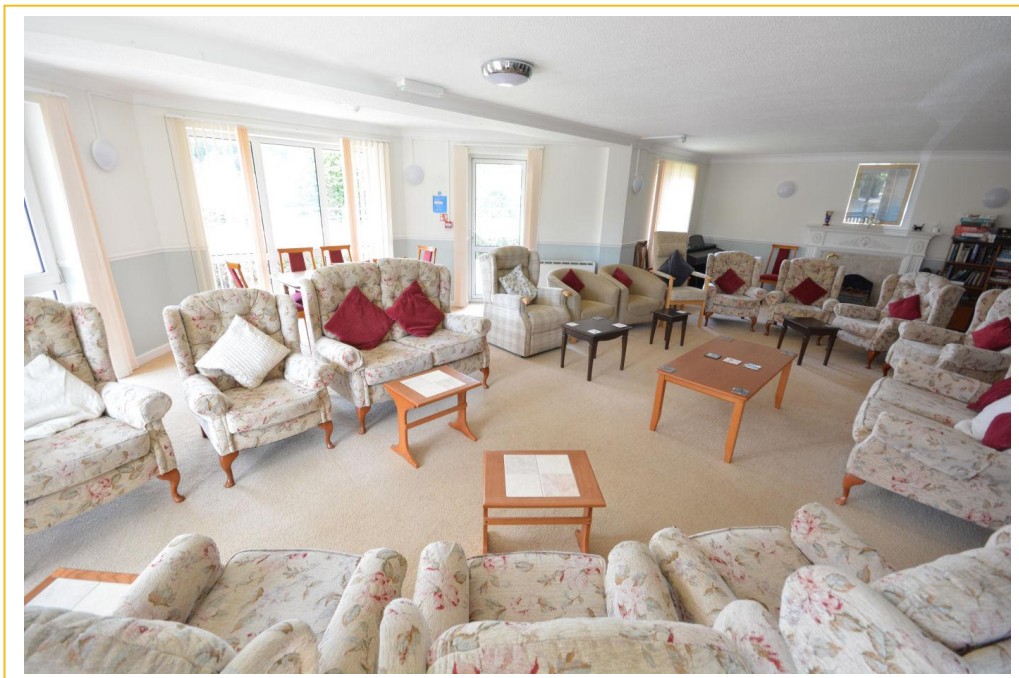
COMMUNAL LOUNGE AREA