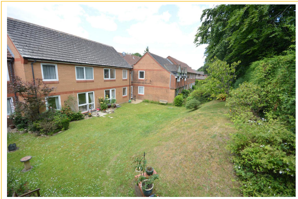
VIEW FROM LOUNGE/DINING ROOM