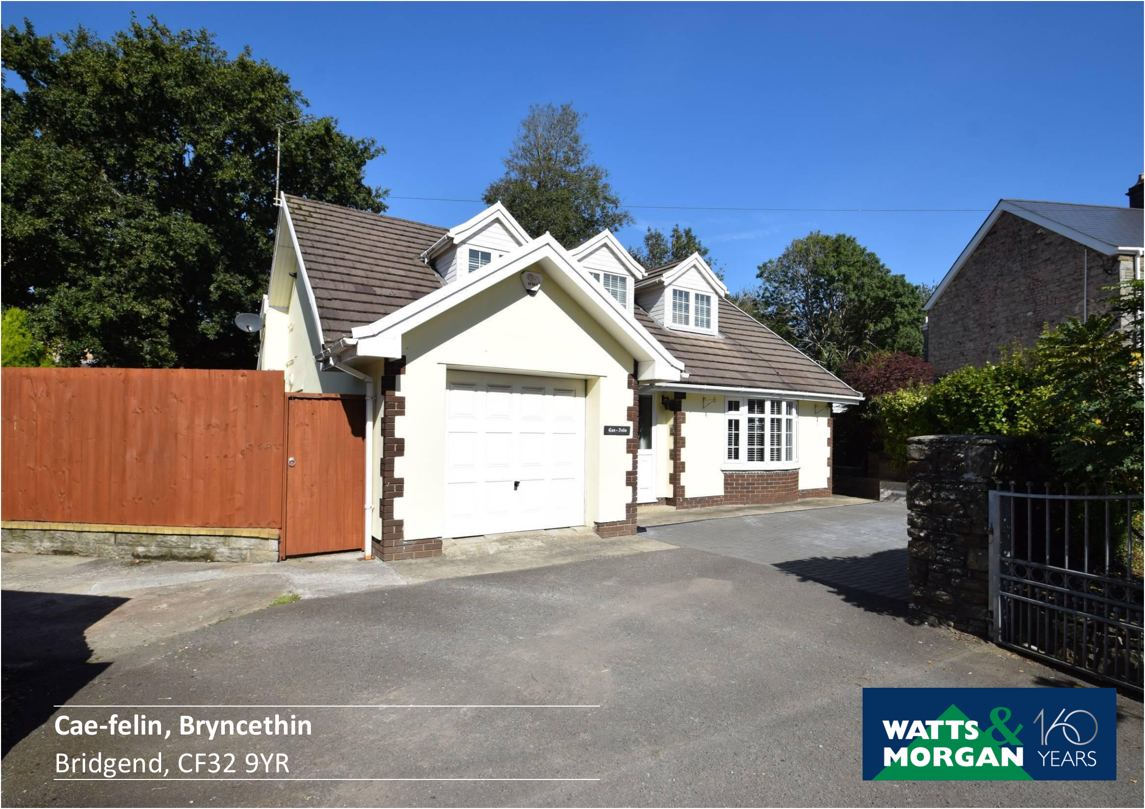
Cae-felin, Bryncethin Bridgend, CF32 9YR